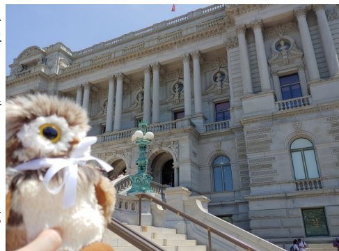
Peachtree City Library mascot -Whoolio the owl admiring Library of Congress

After meeting with my colleagues at a special orientation on the first night, I began my work with the Public Programs Office by assisting at the registration table for the extremely popular program, Beyond the Racial Stalemate . It was inspiring to meet people from all over the country, from all different backgrounds, coming together to talk, laugh, and cry. Many of the participants left saying that they would endeavor to bring similar programs to their own libraries when they got home.