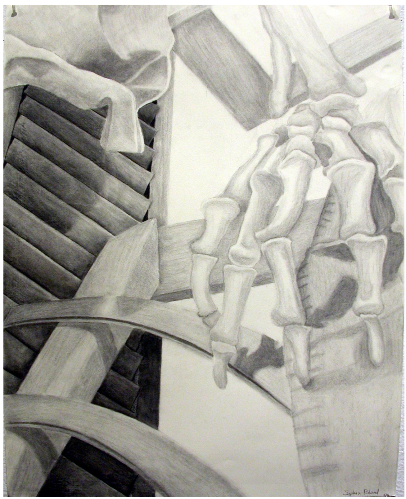
Drawing by student, Sophia Roland

Project: Value / High Contrast with Charcoal (Chiaroscuro)