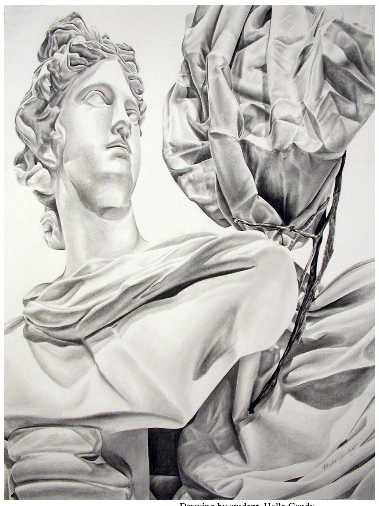
Drawing by student, Halle Gandy

Project: Value / High Contrast with Charcoal (Chiaroscuro)